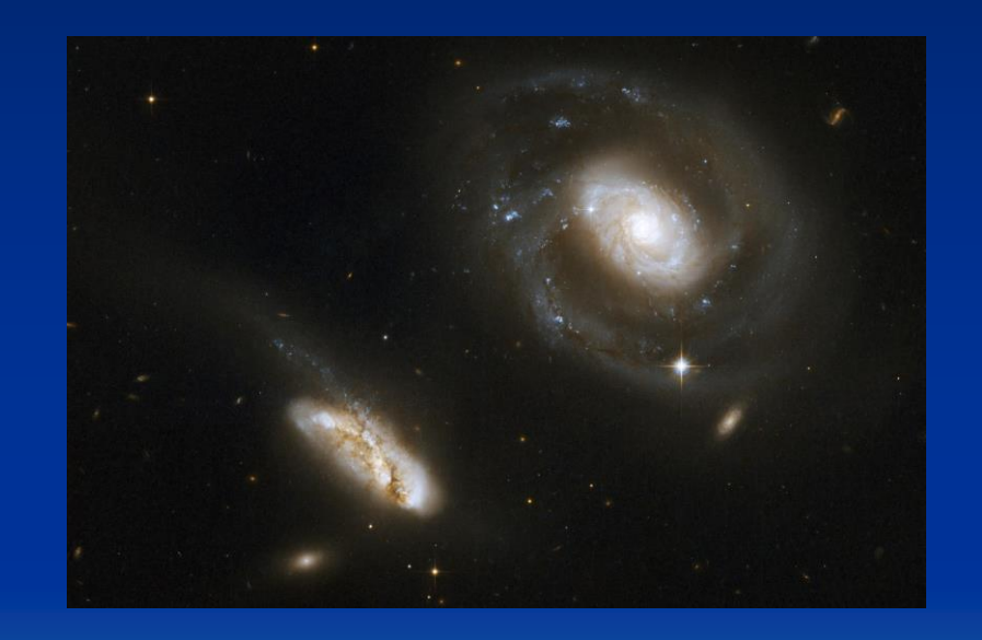
Galaxy Mergers in Radio Light